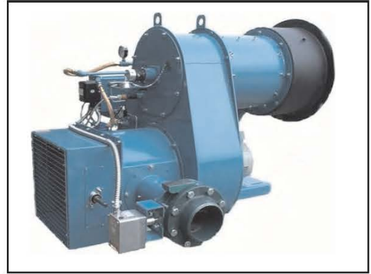
Webster Model HDRMB™ Ultra Low NOx Burner

*U.S. Patent Numbers 5,407,347 and 5,470,224